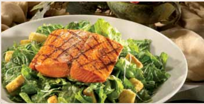
Salmon Caesar Salad