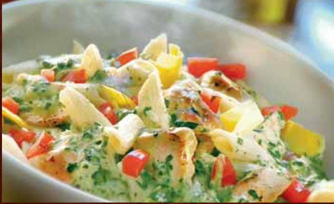
Artichoke Spinach Pasta