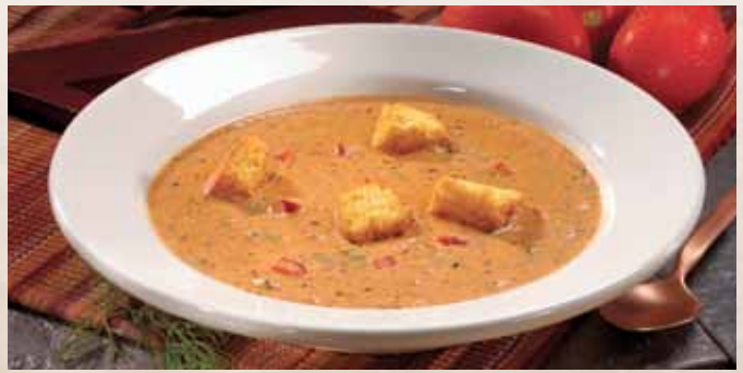
Tomato Florentine Soup